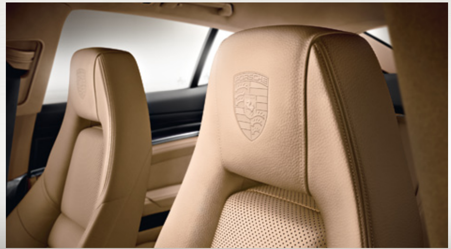
Headrest with Porsche Crest