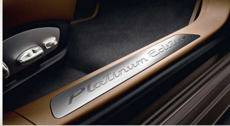
Door sill guard with 'Platinum Edition' logo