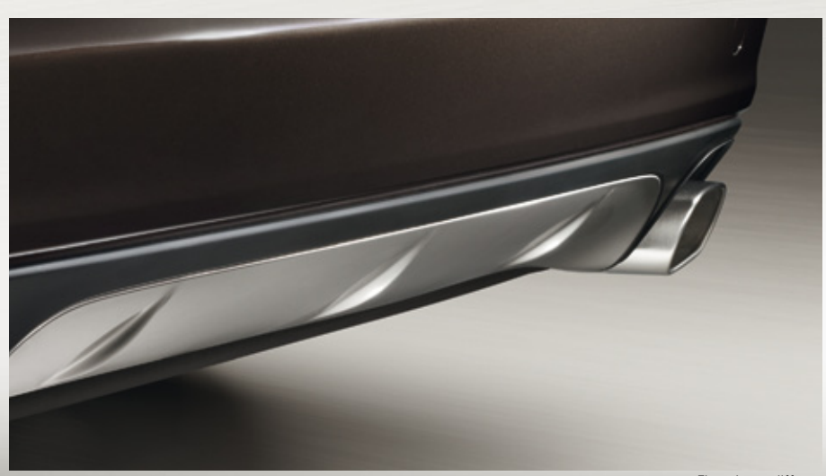
Finned rear diffuser