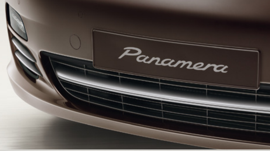
Slats in the front apron