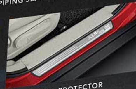
SS DOOR SILL PROTECTOR