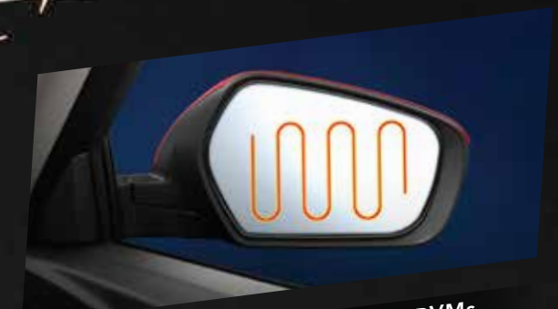
FIRST-IN-SEGMENT HEATED ORVMs