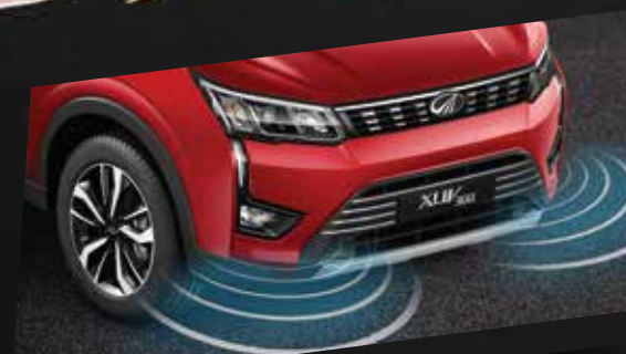
FIRST-IN-SEGMENT FRONT PARKING SENSORS