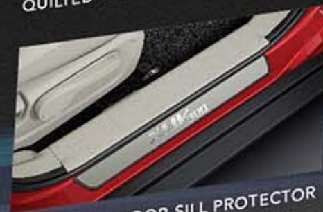
ALUMINIUM DOOR SILL PROTECTOR