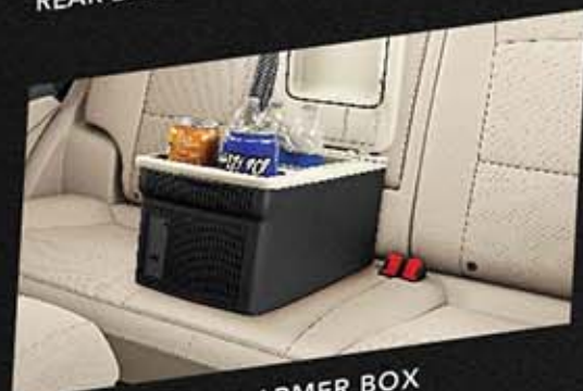
CAR CHILLER & WARMER BOX