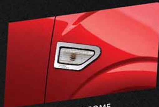
FENDER GARNISH CHROME