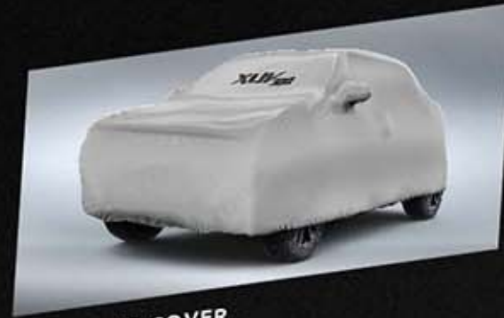
SILVER CAR COVER