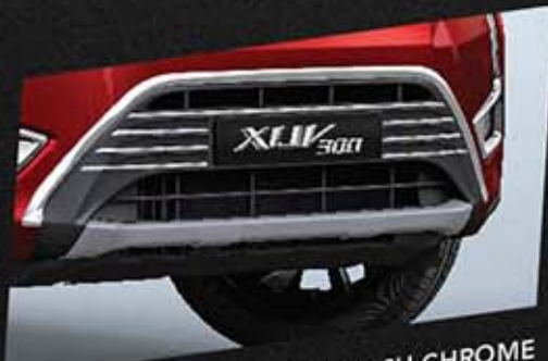
FRONT MIDDLE GRILLE GARNISH CHROME