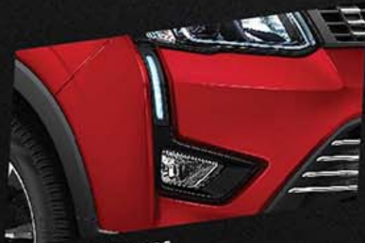
FRONT FOG LAMPS