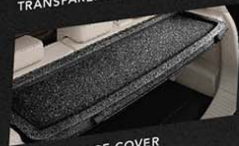
REAR LUGGAGE COVER

ALSO AVAILABLE: BLACK PVC | RUGGED SMOKE GREY PVC | FULL FLOOR MAT LAMINATION | BOOT/TRUNK MAT