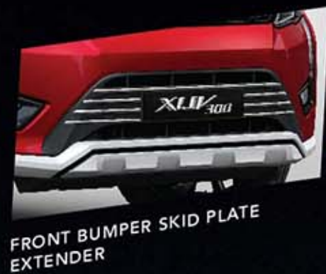
FRONT BUMPER SKID PLATE EXTENDER