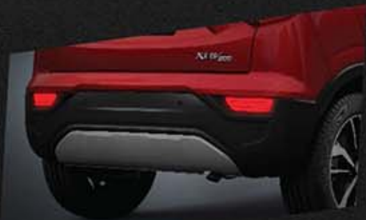
REAR LED REFLECTORS