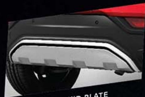
REAR BUMPER SKID PLATE EXTENDER