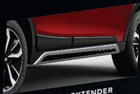
SIDE SKID PLATE EXTENDER