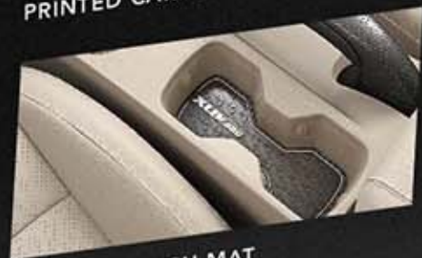
ANTI-SKID DASH MAT