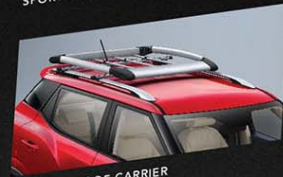
DYNAMIC ROOF CARRIER