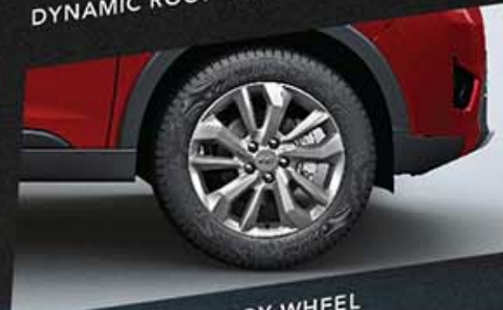
43.18 cm SILVER ALLOY WHEEL