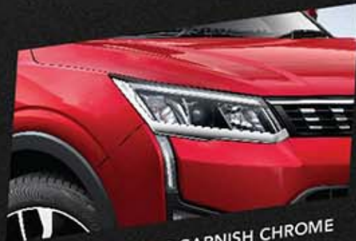
SPORTY HEAD LAMP GARNISH CHROME