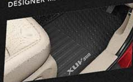
RUGGED PVC MAT