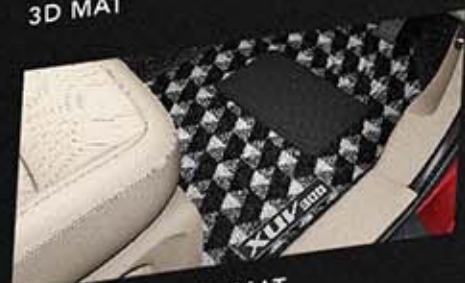
PRINTED CARPET MAT