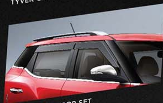
BLACK DOOR VISOR SET