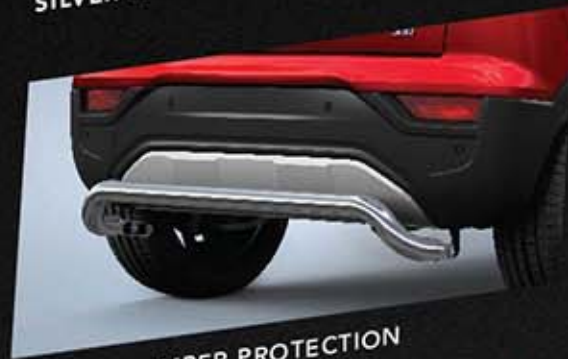
SS REAR BUMPER PROTECTION