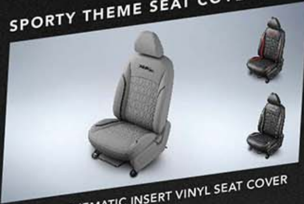
QUILTED + THEMATIC INSERT VINYL SEAT COVER