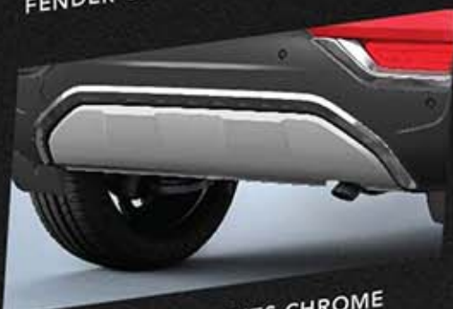
REAR BUMPER ACCENTS CHROME