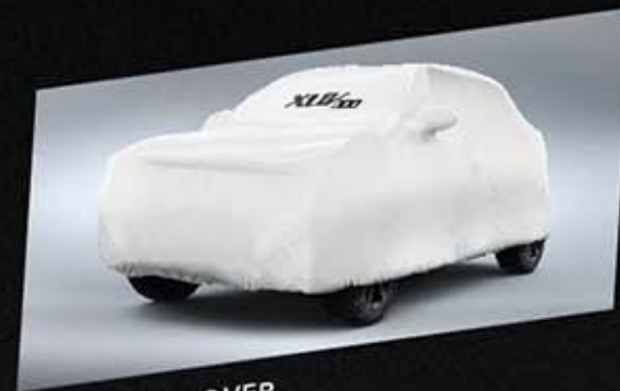
TYVEK CAR COVER