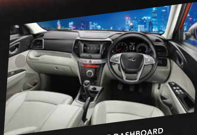
DUAL-TONE BLACK & BEIGE DASHBOARD