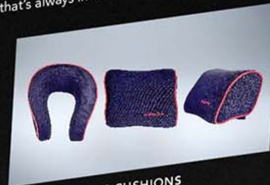
MEMORY FOAM CUSHIONS