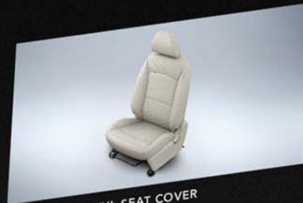
OE DESIGN VINYL SEAT COVER