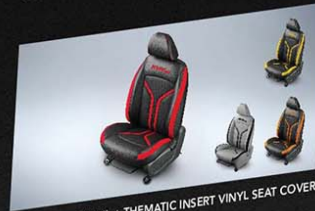
PERFORATED VINYL + THEMATIC INSERT VINYL SEAT COVER