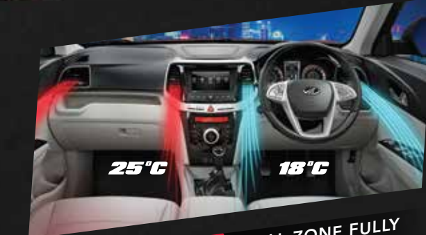
FIRST-IN-SEGMENT DUAL-ZONE FULLY AUTOMATIC TEMPERATURE CONTROL