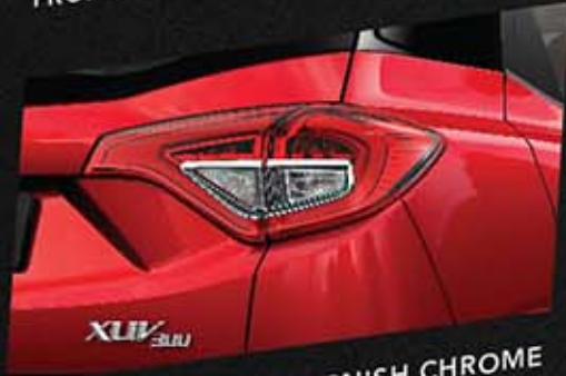
SPORTY TAIL LAMP GARNISH CHROME