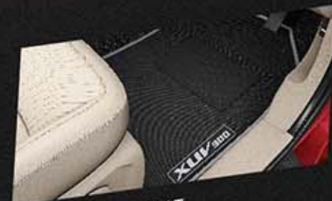
PLAIN CARPET MAT