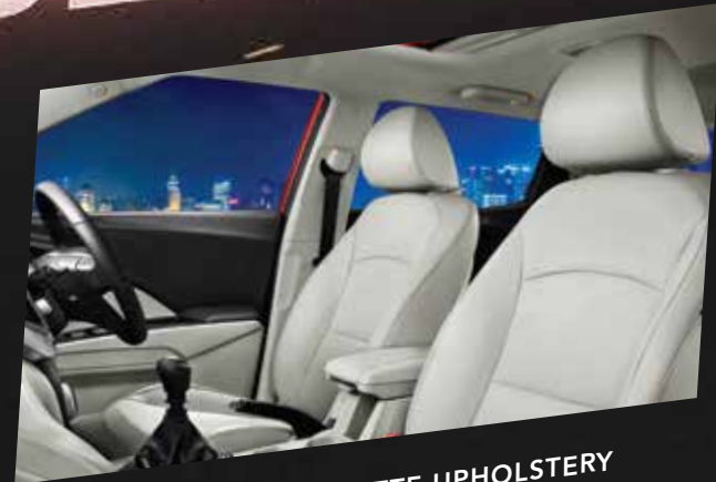
PREMIUM GREY LEATHERETTE UPHOLSTERY