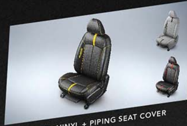
PERFORATED VINYL + PIPING SEAT COVER