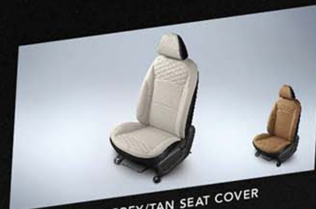
QUILTED VINYL GREY/TAN SEAT COVER