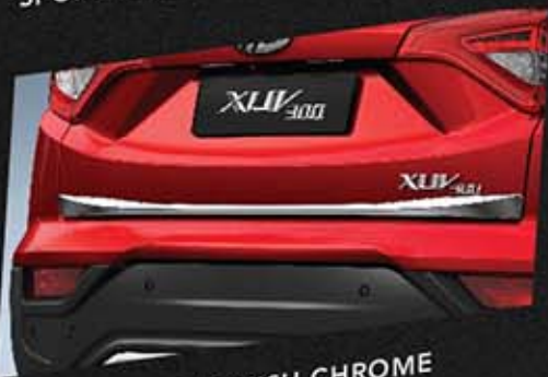
BACK DOOR GARNISH CHROME