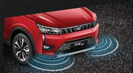
FRONT PARKING SENSORS