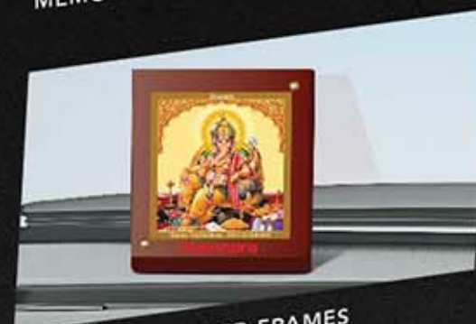
DIVINITY IDOLS AND FRAMES