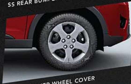
40.64 cm SILVER WHEEL COVER