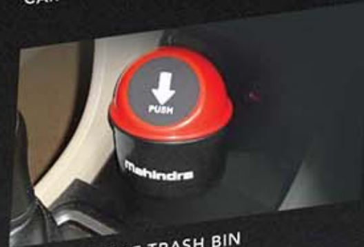
MULTIPURPOSE TRASH BIN