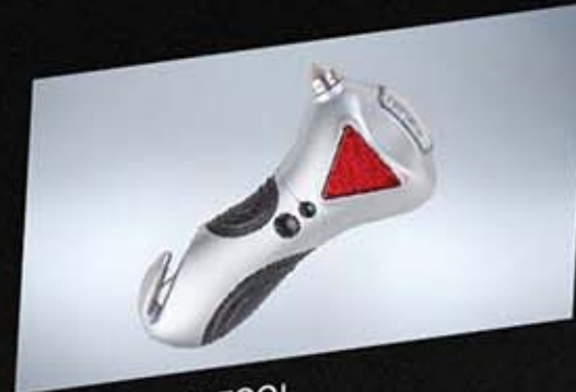
4-IN-1 SAFETY TOOL