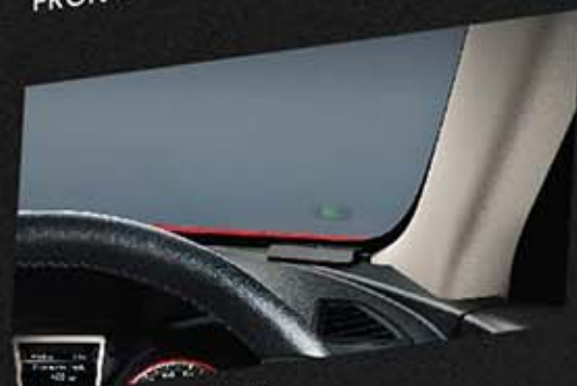
HEADS UP DISPLAY