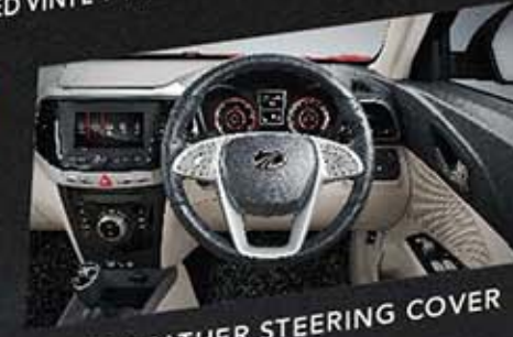
NAPPA LEATHER STEERING COVER

ALSO AVAILABLE: DOOR TRIM ARMREST - GREY & TAN