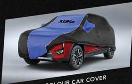
SPORTY DUAL-COLOUR CAR COVER