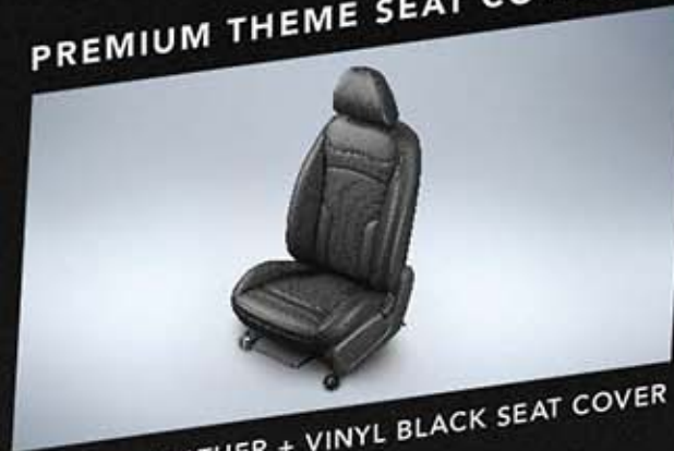
GENUINE LEATHER + VINYL BLACK SEAT COVER