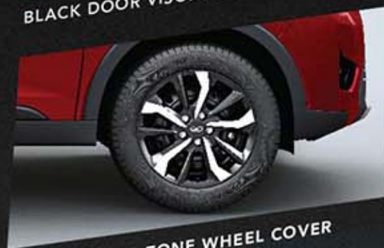
40.64 cm DUAL-TONE WHEEL COVER