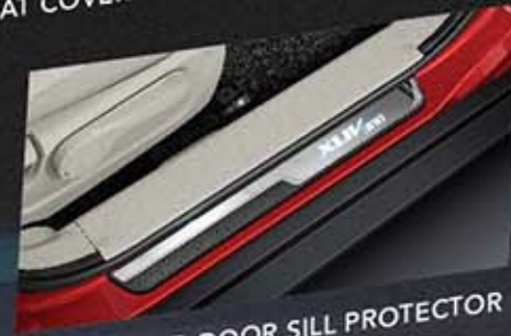
ILLUMINATED DOOR SILL PROTECTOR