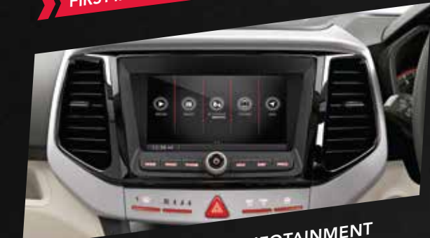
17.78 CM TOUCHSCREEN INFOTAINMENT WITH GPS NAVIGATION, APPLE CARPLAY & ANDROID AUTO™

The XUV300 allows you to adjust the air temperature to create separate, customised environments for the driver and front passenger. With 3 memory slots for your preferred setting, you won't waste time prepping up for your joyride.