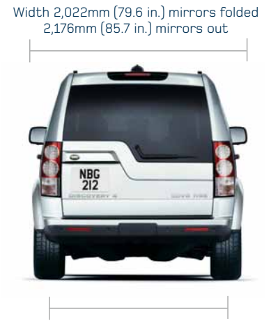
Rear wheel track 1,612.5mm (63.5 in.)