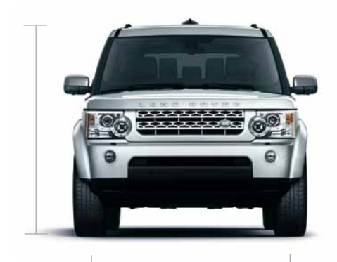
Front wheel track 1,605mm (63.2 in.)