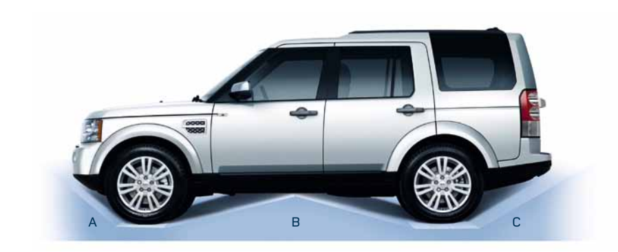
Off-road Geometry Off-road ride height