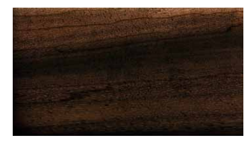
Ebony Windsor Leather with Ivory contrast stitching Ebony Windsor Leather door top and facia Dark Zebrano Veneer