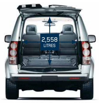
Maximum loadspace - seats folded