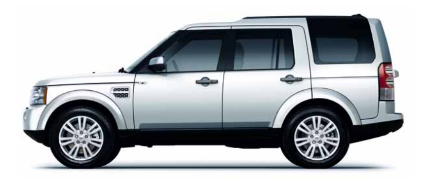
Wheelbase 2,885mm (113.6 in.)