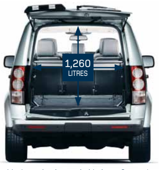
Maximum loadspace behind row 2 - seats up

Shoulder room - mm (inch) 1st row 1,503 (59.2) 2nd row 1,499 (59) 3rd row 1,087 (42.8)