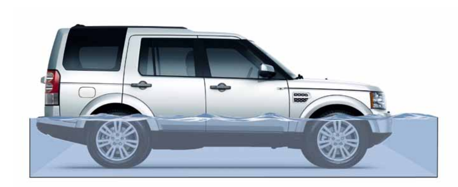
Wading Depth Maximum wading depth 700mm