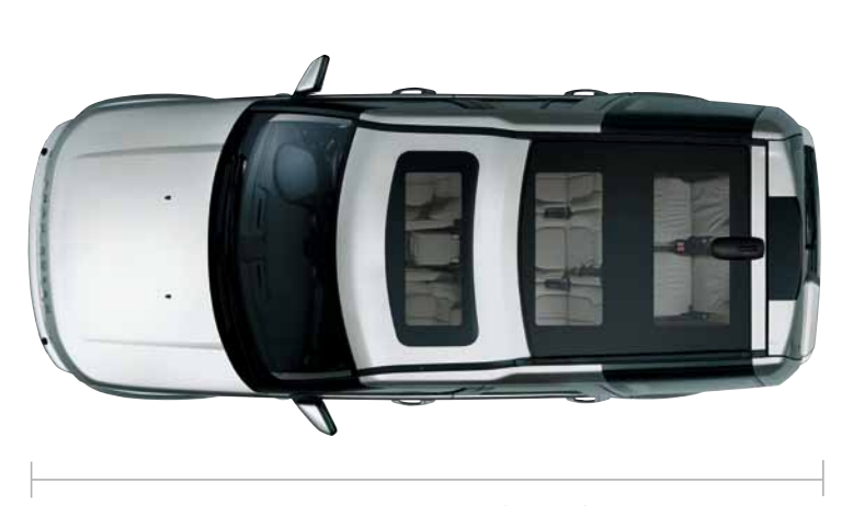
Overall length 4,829mm (190.1 in.)