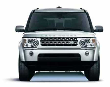
Obstacle Clearance Ground clearance up to 310mm Standard ride height 185mm