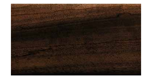
Ivory Windsor Leather with Ebony contrast stitching Ebony Windsor Leather door top and facia Dark Zebrano veneer