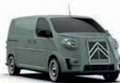
GIADA GREEN AC 539 - Pastel