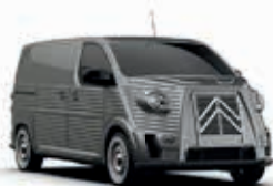
PLATINUM GREY - Metallic *