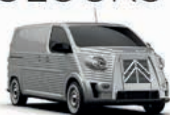
ARTENSE GREY - Metallic *