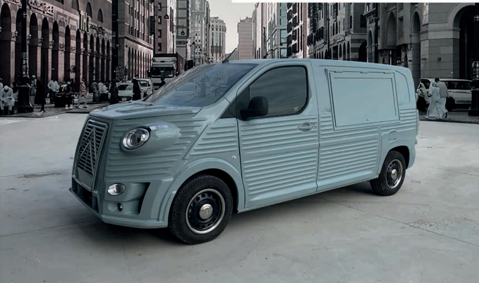
MOBILE SHOP/MINI FOOD TRUCK OLD STYLE WITH SIDE OPENING.