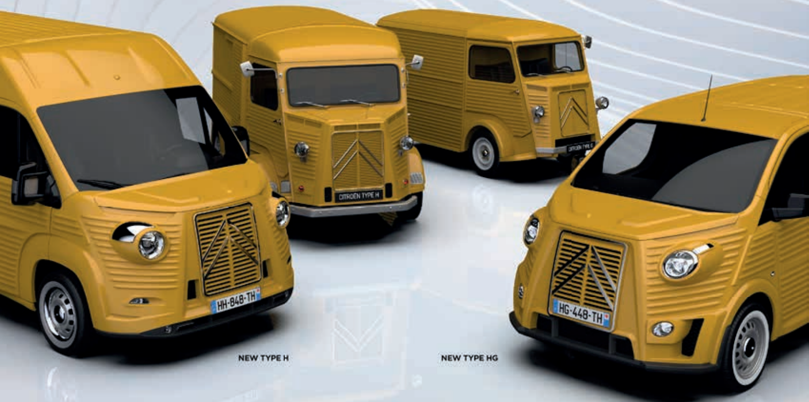
NEW TYPE H

Today, our TYPE H based on Jumper is joined by a smaller model, the TYPE HG, based on the Citroën Jumpy(Dispatch)/SpaceTourer to meet the needs of customers who looking for a customised vehicles with attention to detail.