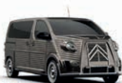
RICH OAK BROWN - Metallic **