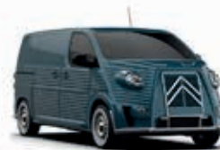
WEEK-END BLUE AC 625 - Pastel

* : Only with base vehicle of the same colour