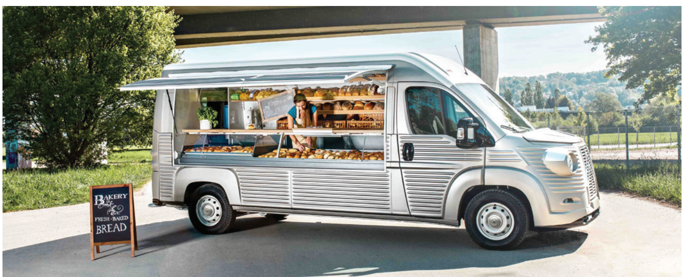
OLD STYLE FOOD TRUCK