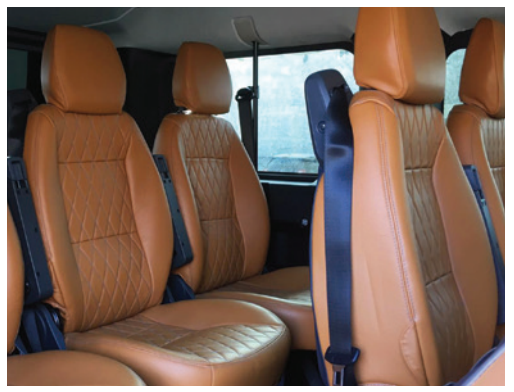
TYPE H Pallas Packet Leather seats