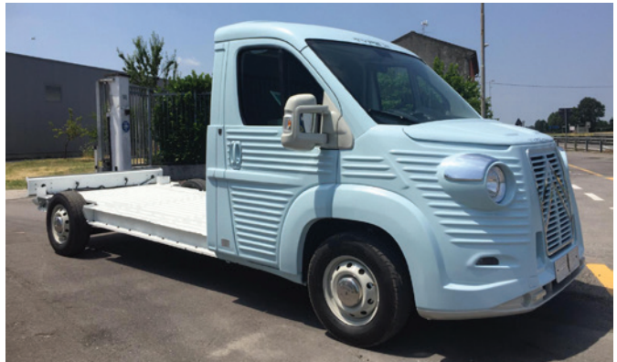
Chassis Low-floor Chassis