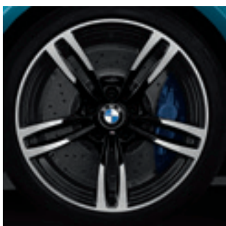
19" M Double-spoke style 437 M, Black