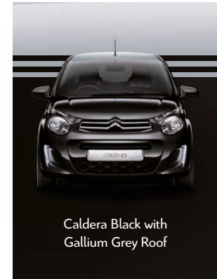
Caldera Black with Gallium Grey Roof