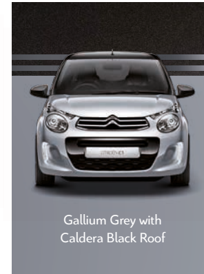
Gallium Grey with Caldera Black Roof