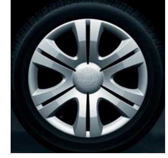
tyres with Satellite hub covers.