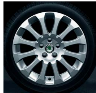
6.5J x 16" Comet alloy wheels for 205/45 R16 tyres.