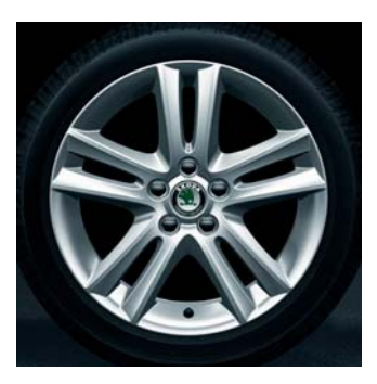
6.5J x 16" Elba alloy wheels for 205/45 R16 tyres.