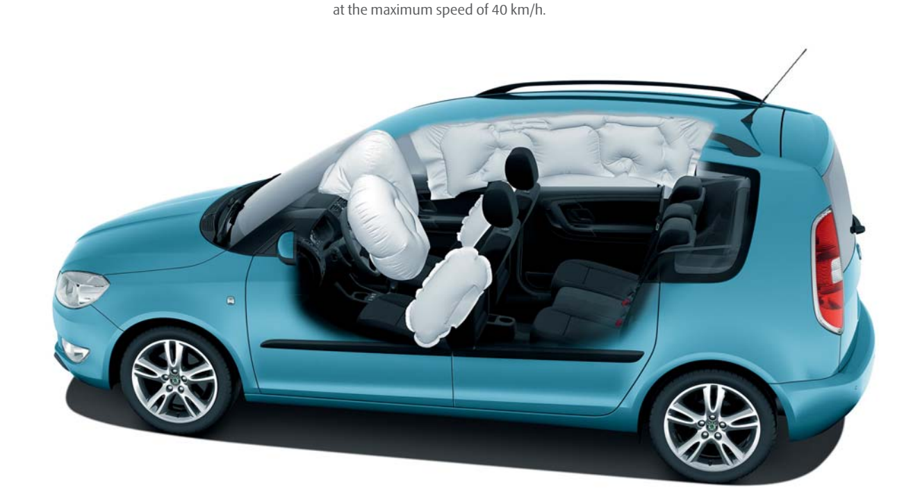
New Roomster cars may be equipped with up to 6 airbags for your protection: driver and front passenger airbags, front side airbags and head airbags.