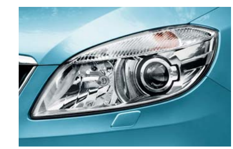
The vehicle may also be equipped with tilting halogen projector headlamps for the enhancement of corner driving safety.