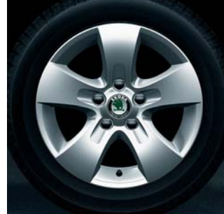
6.0J x 14" Atik alloy wheels for 185/65 R14 tyres.