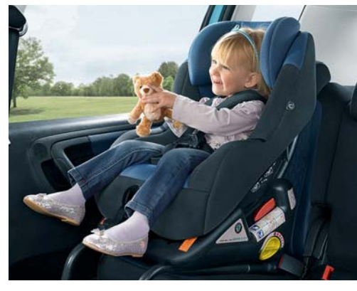
The standard safety equipment of new Roomster cars includes mount preparation for two child seats with the Isofix system including special safety belt anchoring which is an essential part of the Top Tether child seat .