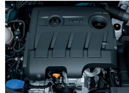
The highest performance diesel engine developed for the new Roomster is the 1.6 TDI CR DPF/77kW turbocharged 4-cylinder engine.