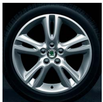
6.5J x 16" Atria alloy wheels for 205/45 R16 tyres.