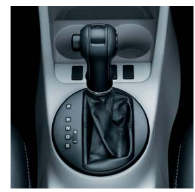
The new automatic 7-speed DSG transmission designed exclusively for the 1.2 TSI/77kW engine guarantees comfortable yet dynamic drive with