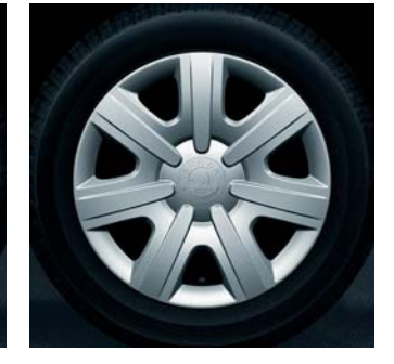
tyres with Comoros hub covers.