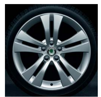
7.0J x 17" Trinity alloy wheels for 205/40 R17 tyres.