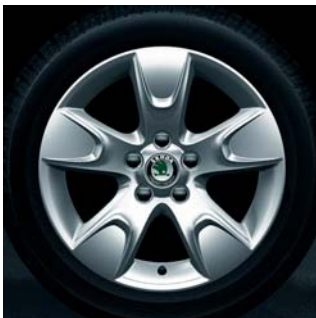
6.0J x 15" Avior alloy wheels for 195/55 R15 tyres.