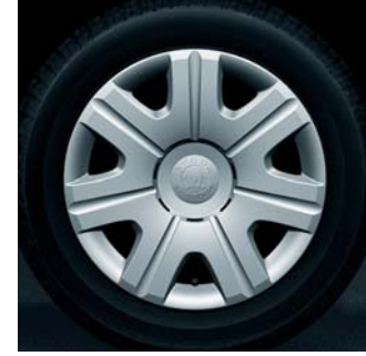
6.0J x 15" steel wheels for 195/55 R15 6.0J x 14" steel wheels for 185/65 R14 5.0J x 14" steel wheels for 175/70 R14 tyres with Castor hub covers.