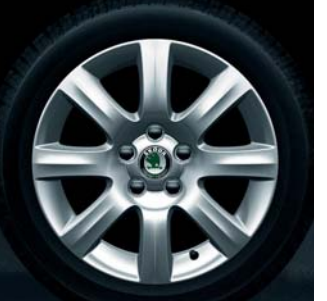
6.0J x 15" Line alloy wheels for 195/55 R15 tyres.