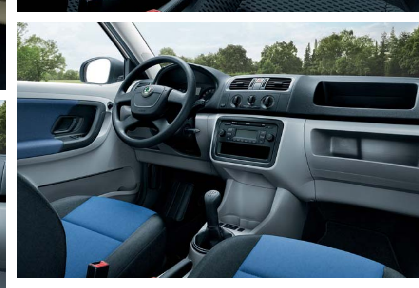
Roomster (basic equipment version)

The Stone grey or blue interior with the Onyx/Onyx or Onyx/Silvergrey dashboard.