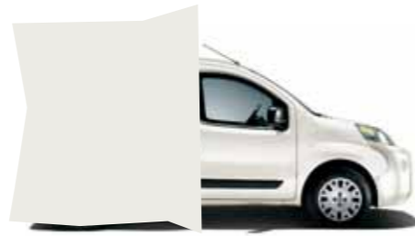
249 AMBIENT WHITE