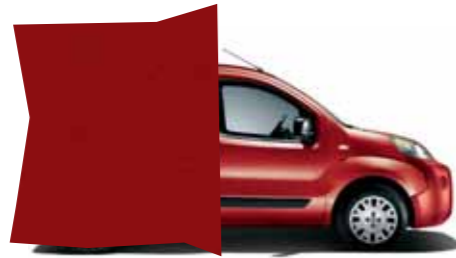
163 BOLERO RED