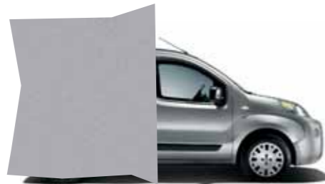
612 MINIMAL GREY