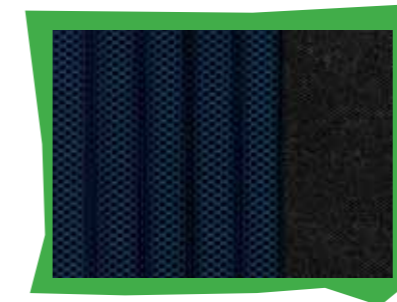
275 BLACK / BLUE SAIL