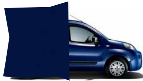
487 COOL JAZZ BLUE