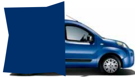
479 LINE BLUE