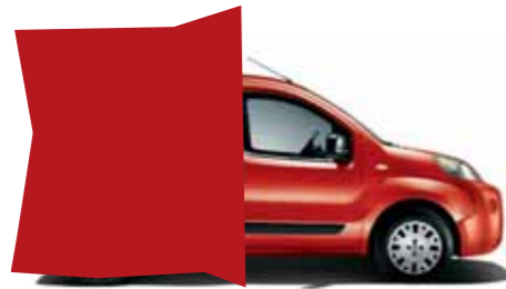
199 RUMBA RED