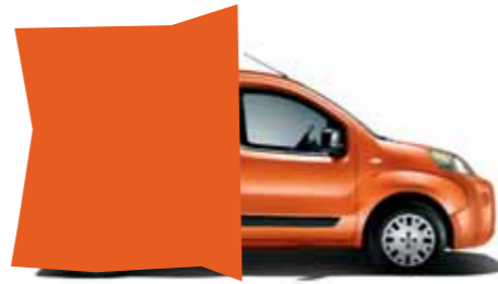
551 FUNKY ORANGE