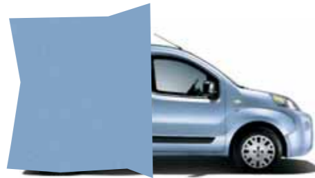
484 FOX-TROT AZURE