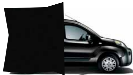
632 ROCKABILLY BLACK