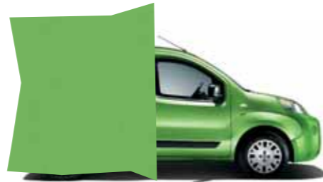
355 DISCO GREEN