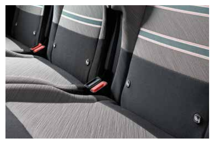
x3 ISOFIX mounts - Standard across the range

We know how important it is to present the right facts and figures, so our brochures are regularly updated, however it is important that you consult your dealer when ordering your vehicle to ensure you are advised of the latest specifications and equipment.