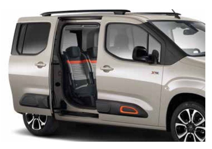
Twin sliding side doors - Standard across the range