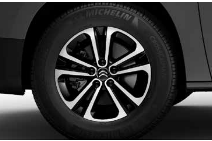
16" 'Starlit' Alloy Wheels - Standard on Feel versions