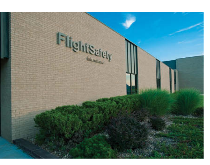
FlightSafety Learning Centers are located at major business aviation airports and feature state-of-the art training equipment and course materials that have been developed in close cooperation with Cessna.

BACKED BY AN INDUSTRY-LEADING WARRANTY. Your Citation Mustang comes with one of the most comprehensive airframe warranties available. The airframe, engines, and Cessna-made components are covered for three years or 1,000 operating hours. Garmin avionics are covered for two years, and all other components are warrantied for one year. And you will never deal with multiple vendors for an issue. All warranty work is administered by Cessna, and no manufacturer has more experience in keeping your aircraft in peak performance. In addition, your purchase price includes enrollment for one year in CESCOM, our electronics maintenance records service that helps ensure your Mustang is compliant with all maintenance requirements.