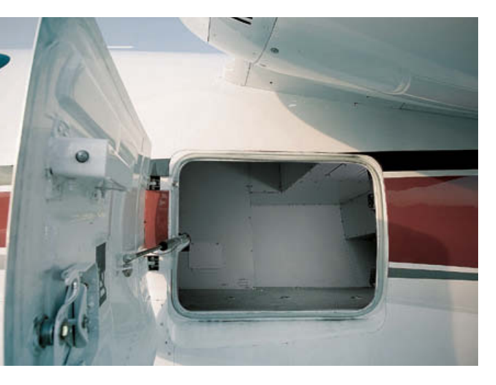
The Mustang's two external compartments accommodate 57 cu. ft. of baggage, so you can bring along what you need and still travel without cluttering the cabin interior with gear.